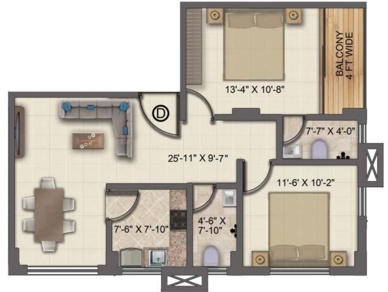
Typical Flat D Size - 1072 sq. ft.