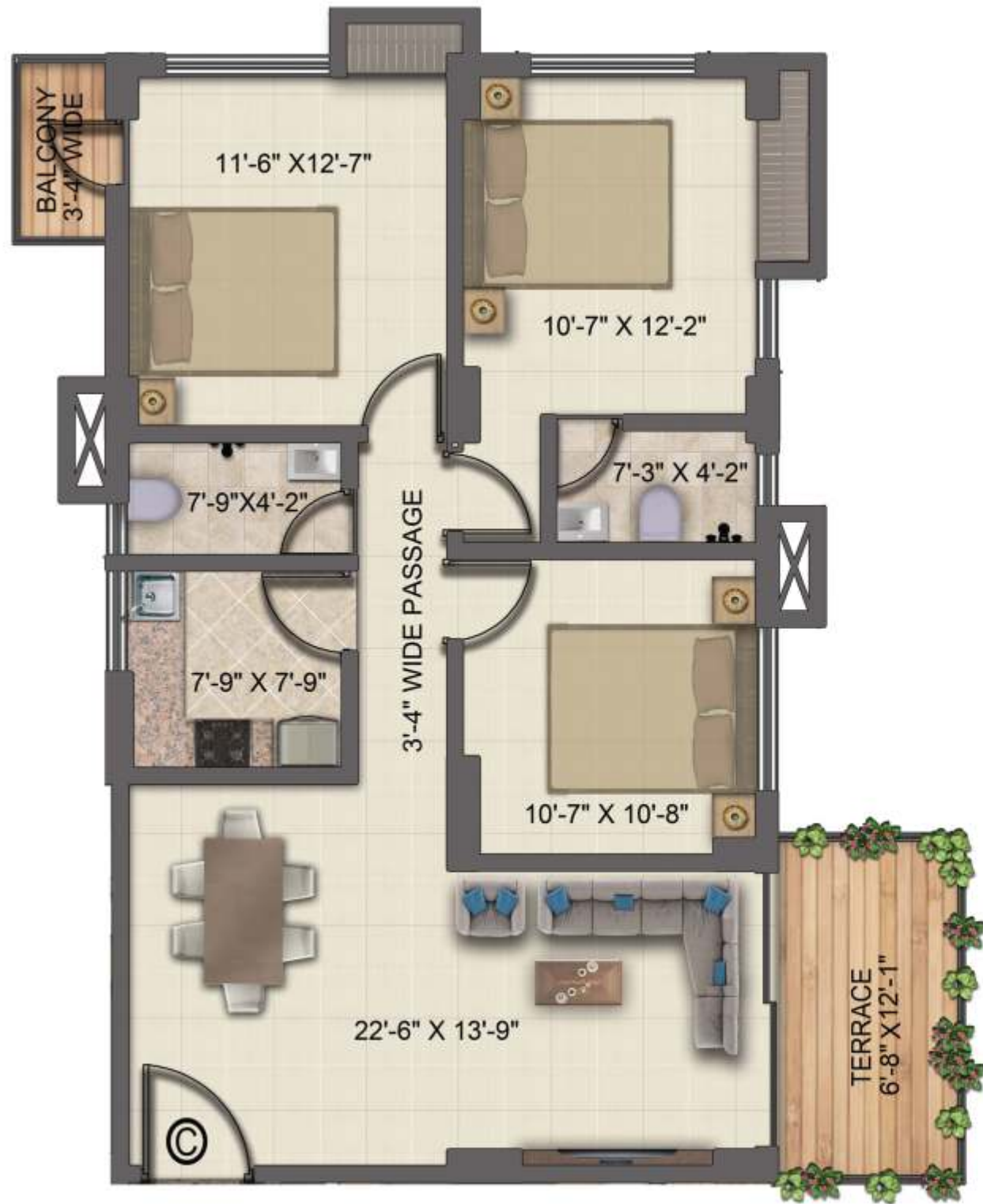
Flat C with Terrace (5th, 8th & 11th floor) Size - 1444 sq. ft.