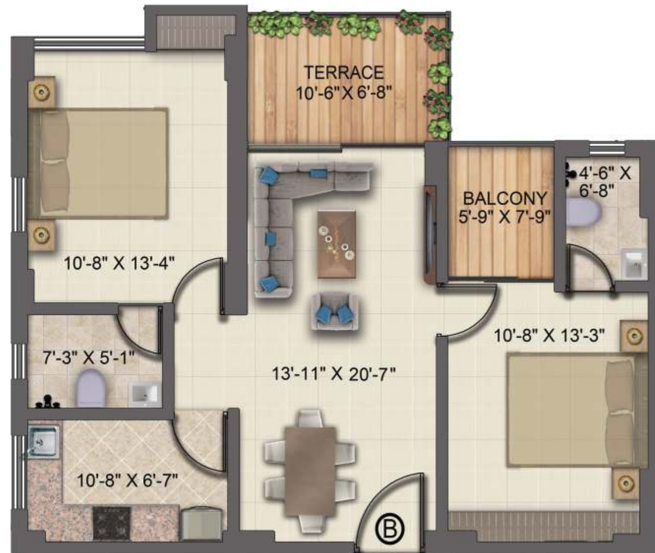
Flat B with Terrace (6th, 9th & 12th floor) Size - 1170 sq. ft.