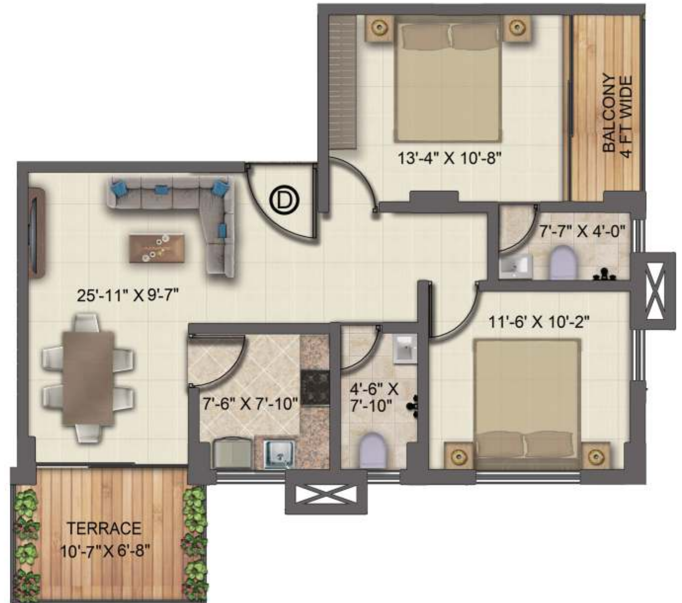
Flat D with Terrace (5th, 8th & 11th floor) Size - 1168 sq. ft.