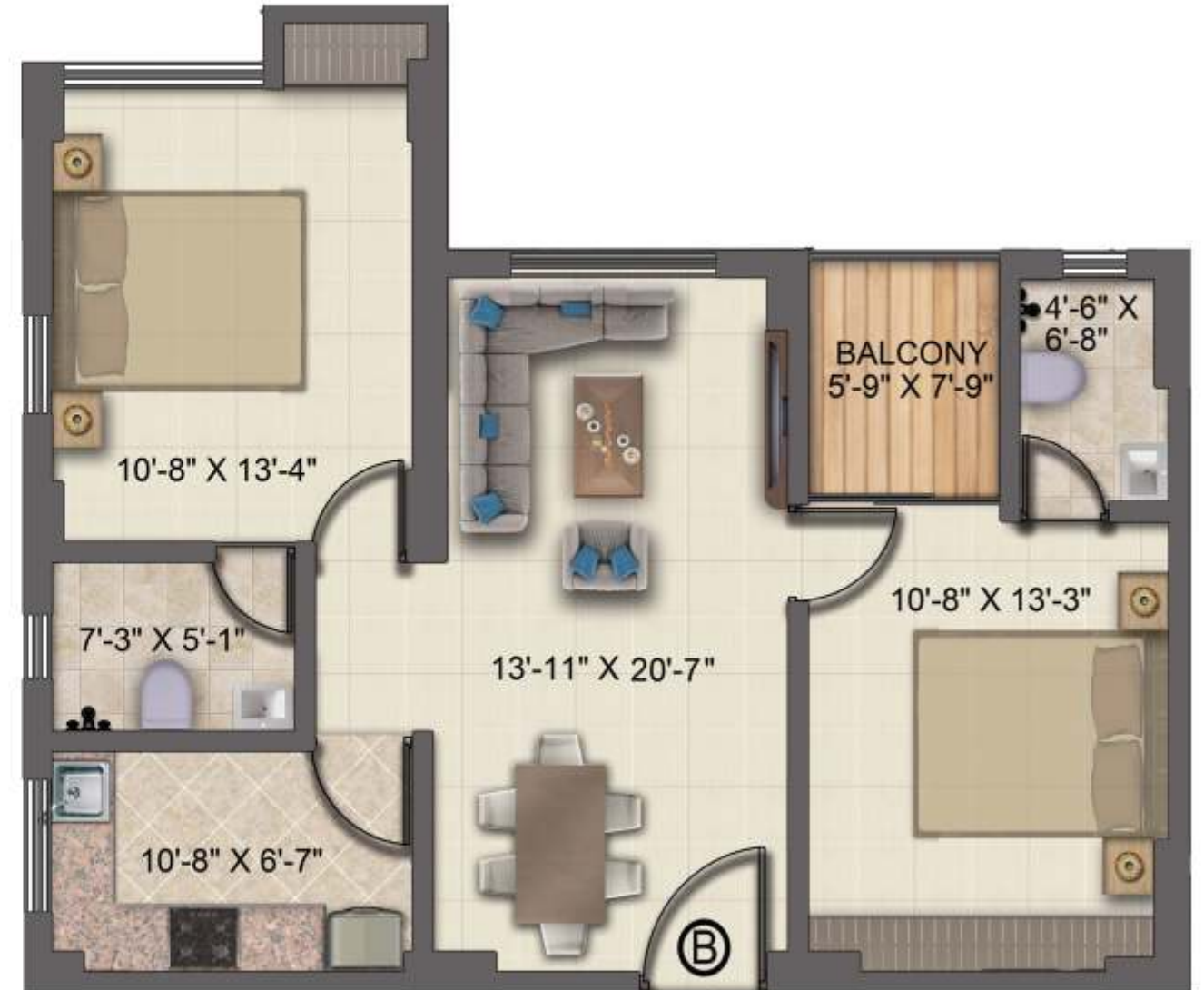
Typical Flat B Size - 1075 sq. ft.