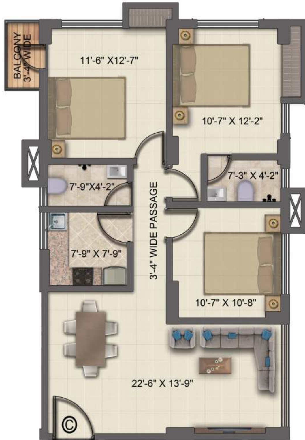
Typical Flat C Size - 1334 sq. ft.