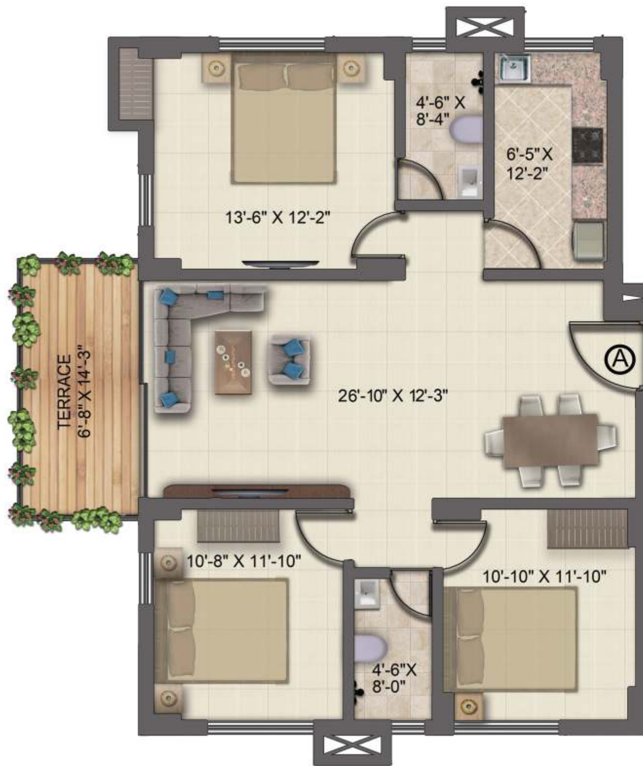
Flat A with Terrace (6th, 9th & 12th floor) Size - 1587 sq. ft.