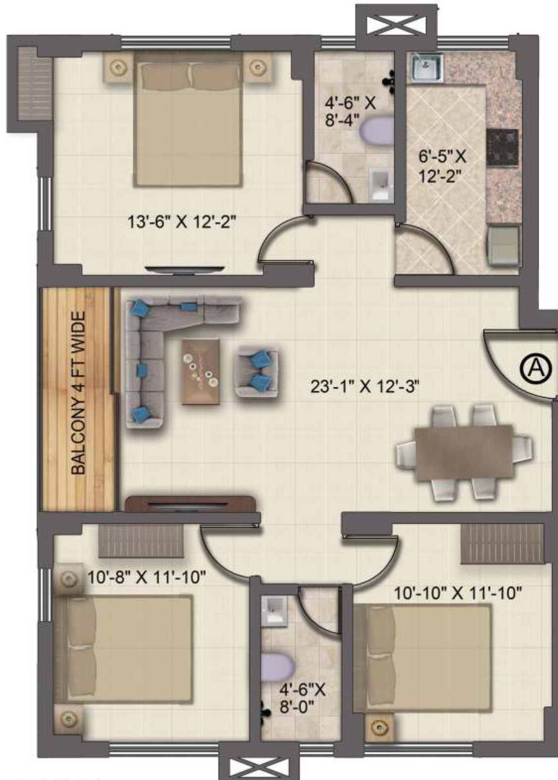
Typical Flat A Size - 1458 sq. ft.